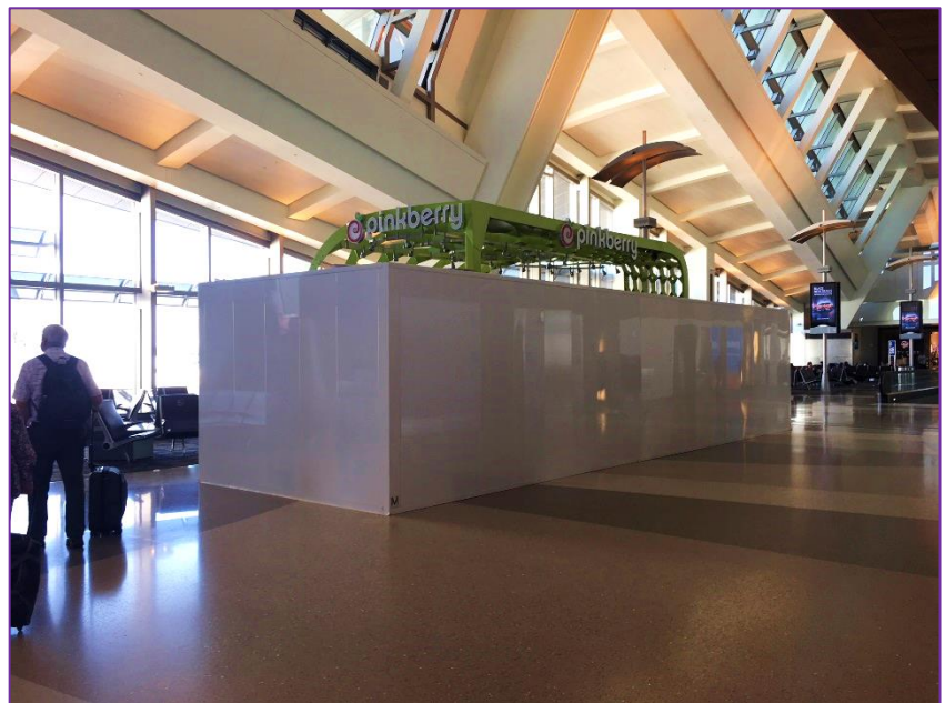
Terminal B, Concourse (Near Gate 155)