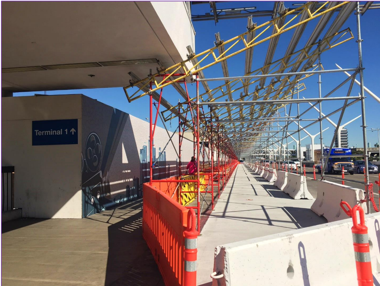
Departures Level, Curbside (between Terminals 1 & 2) Canopy Construction