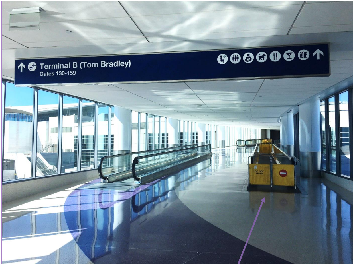
Moving Walkway Under Repair (Terminal B / 4 Connector)