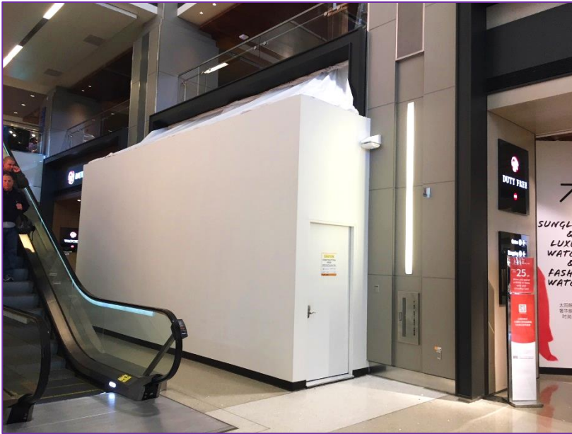
Terminal B, Concourse (Great Hall Area)