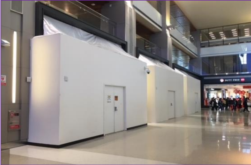
Terminal B DFS / Great Hall Area