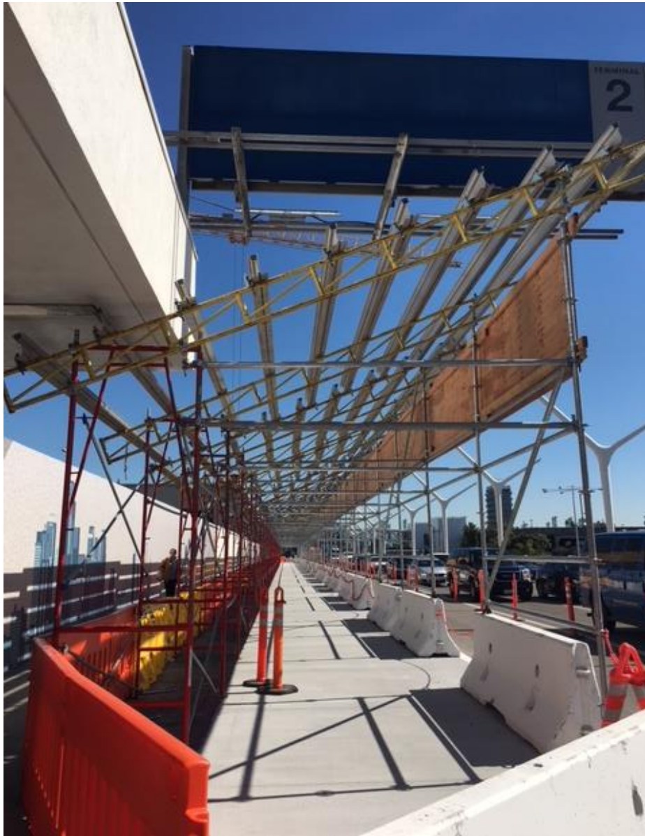
Departures Level, Curbside (between Terminals 1 & 2) Canopy Construction