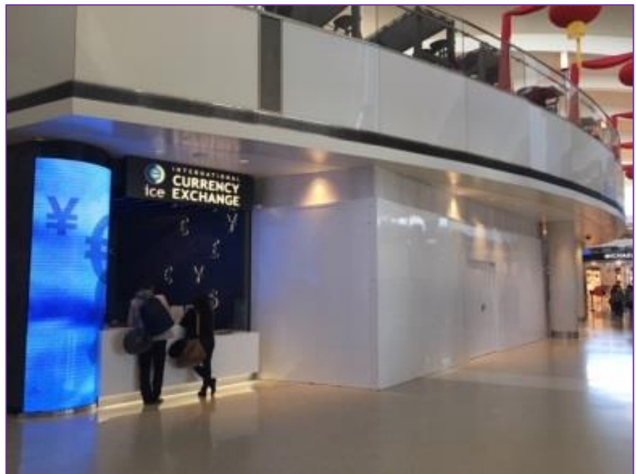
Terminal B, North Concourse (Future Pret a Manger)