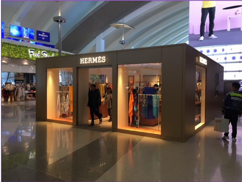
Terminal B, Concourse (Great Hall)